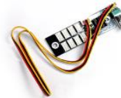
Fan control card 8 cards *1

For further details on installation diagrams, please contact our customer service department.